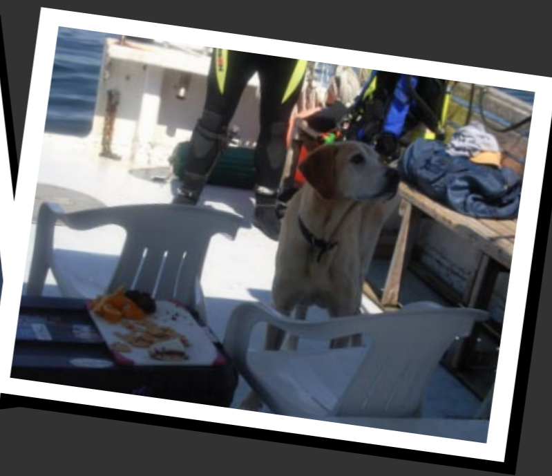
Why can't I have it??