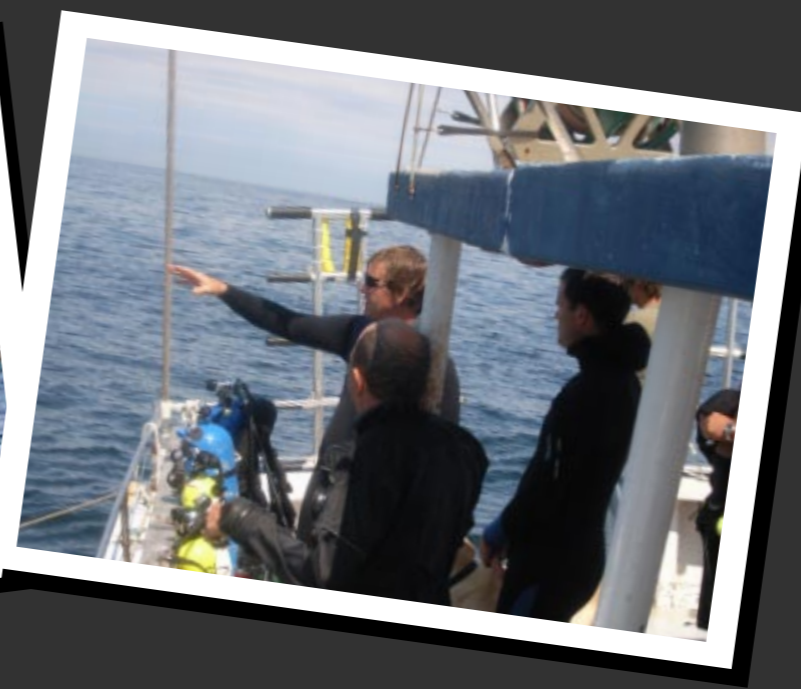
"Right over there"