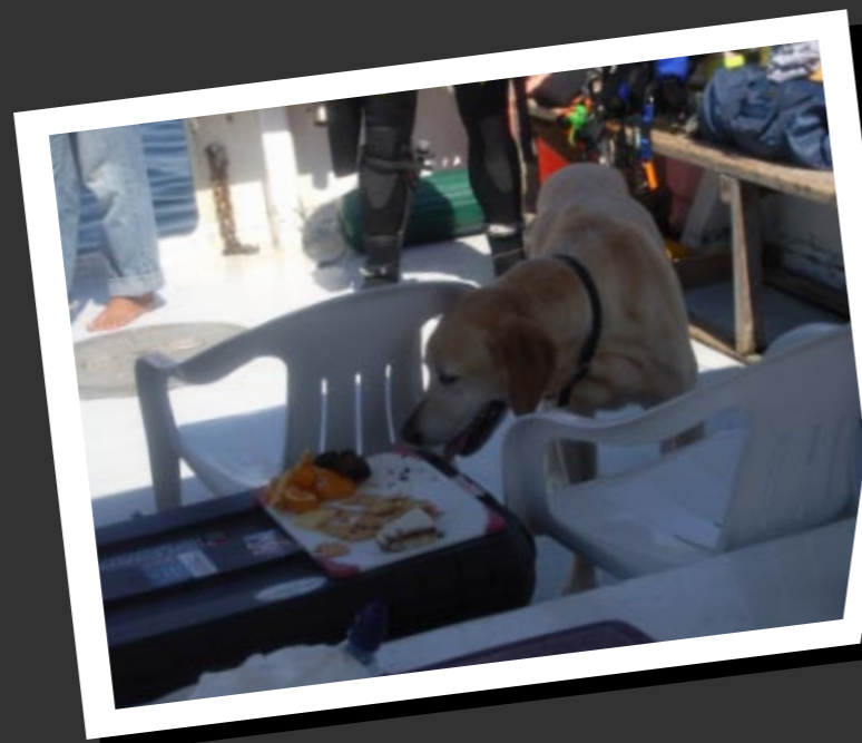
Anybody want the last Brownie??