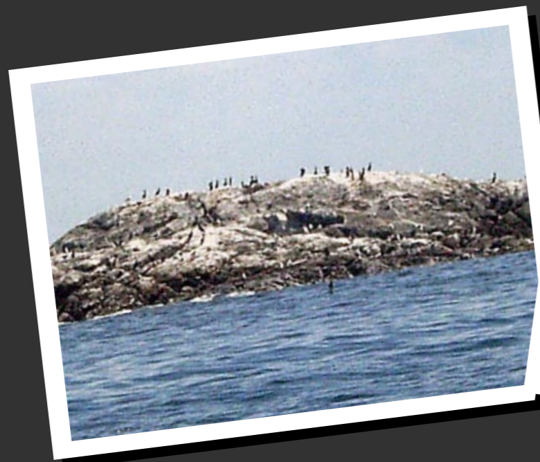
Little Dry Salvages