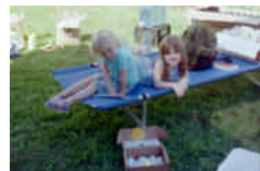
Volunteer shaded lounge Canoe 2004