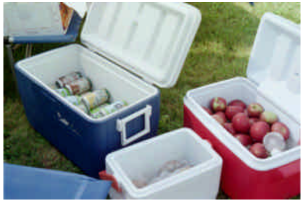
The club provided healthy foods to volunteers