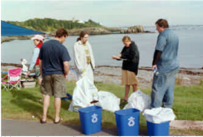
Volunteer divers recording and recycling trash Canoe 2004