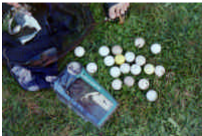
Canoe Beach Cleanup 2004