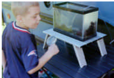
Closer Look Tank showing 2004 Tropicals