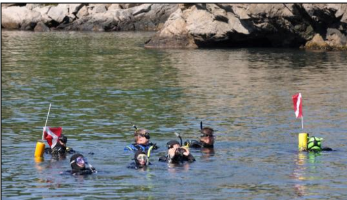
Diving Fort Wetherill, RI at the Tropical Fish Rescue